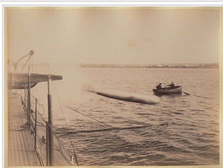
U.S.S. Cushing torpedo boat experiments, ca. 1890